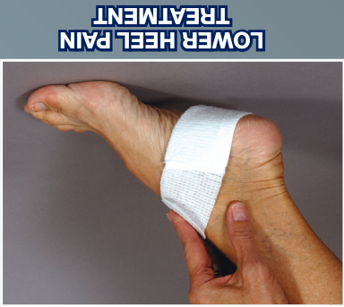
LOWER HEEL PAIN TREATMENT