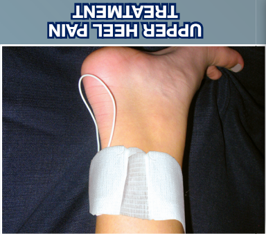
UPPER HEEL PAIN TREATMENT

FOR BEST RESULTS Apply the ActiPatch immediately after surgery or injury. Wear continuously, a minimum of 6 hours, until pain and swelling are gone. ActiPatch is safe to use 24 hours per day and will deliver an estimated 360 hours of treatment. Remove ActiPatch before bathing or showering. Store ActiPatch in a cool dry location.